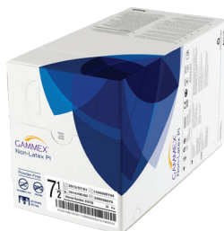
GAMMEX® Non-Latex PI

More O.R. staff around the world prefer Ansell surgical gloves than any other brand. 1