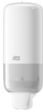
Tork Skincare Dispenser White 561500