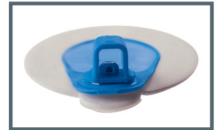
A = 4 mm fitting