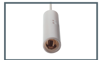
F = 3 mm connector