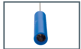
A = 4 mm connector