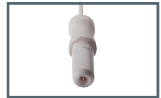
K = 1.5 mm connector